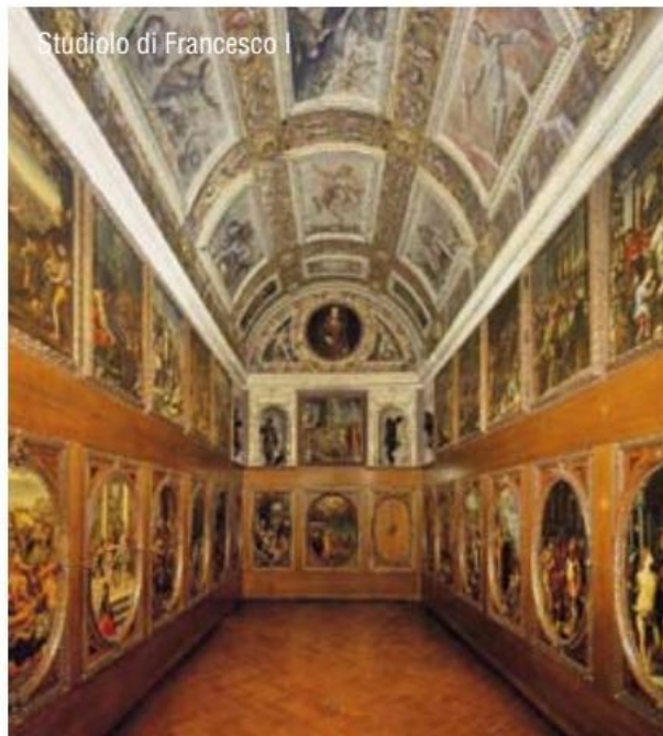
Studiolo di Francesco I